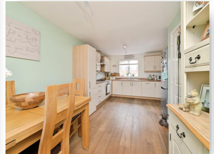
Thistle Close, Yaxley Peterborough PE7 3GF