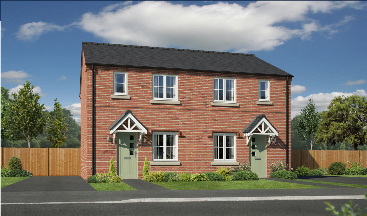
Note: Image for illustrative purposes only. Shown here as a semi-detached.

This three-bedroom home is perfect for those looking to upsize, designed with your family's comfort and convenience in mind.