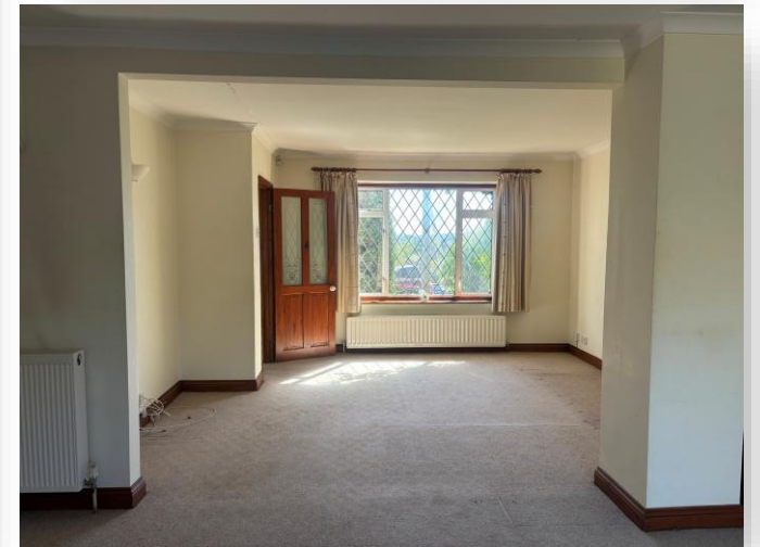
St. Marys Way, Linslade, Leighton Buzzard, LU7 2RX