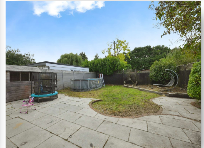
Nazeing Road, Nazeing Waltham Abbey EN9 2HU