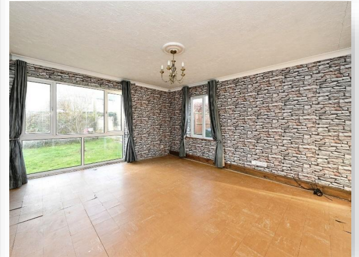
Vicarage Road, Foulden, Thetford, IP26 5AB