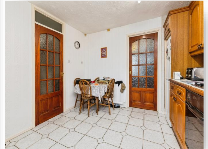
Northgate, Hartlepool TS24 0HH