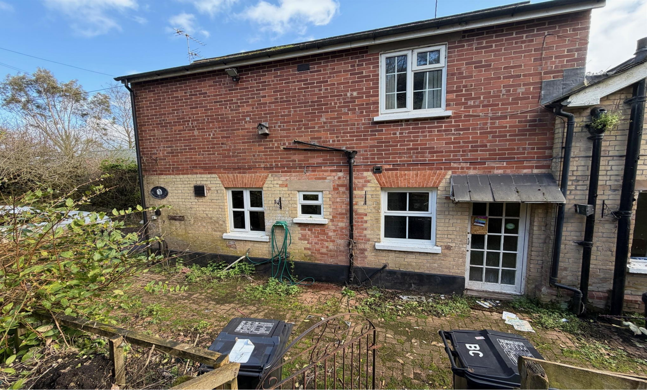
Bolealler Cottage, Cullompton EX15 1RJ