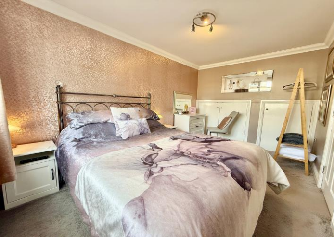
BEDROOM THREE 13' 7" x 6' 8" (4.14m x 2.03m)