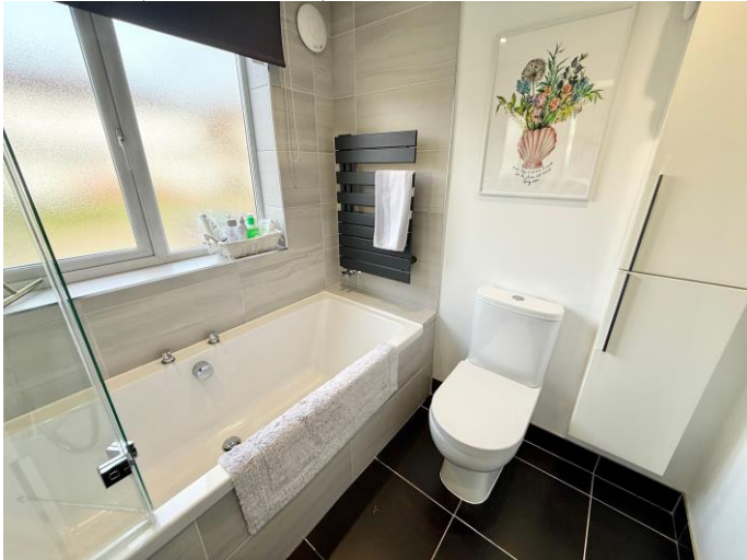
FAMILY BATHROOM 6' 5" x 6' 4" (1.95m x 1.93m)