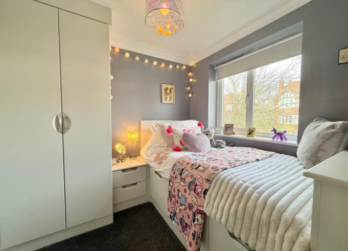
BEDROOM FOUR 7' 7" x 7' 4" (2.31m x 2.23m)