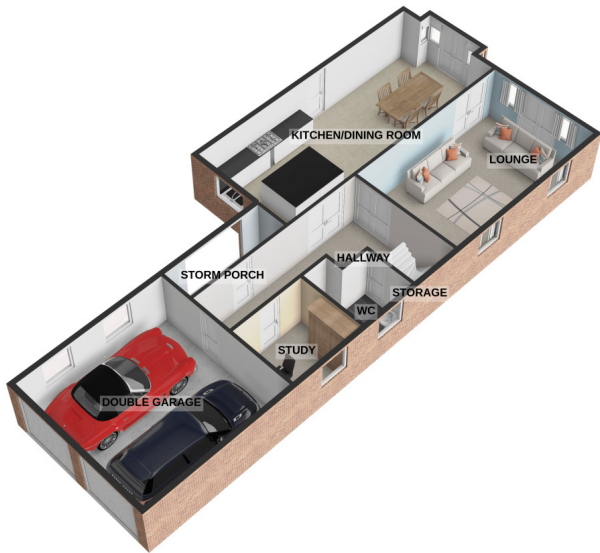
GROUND FLOOR 1281 sq.ft. (119.0 sq.m.) approx.