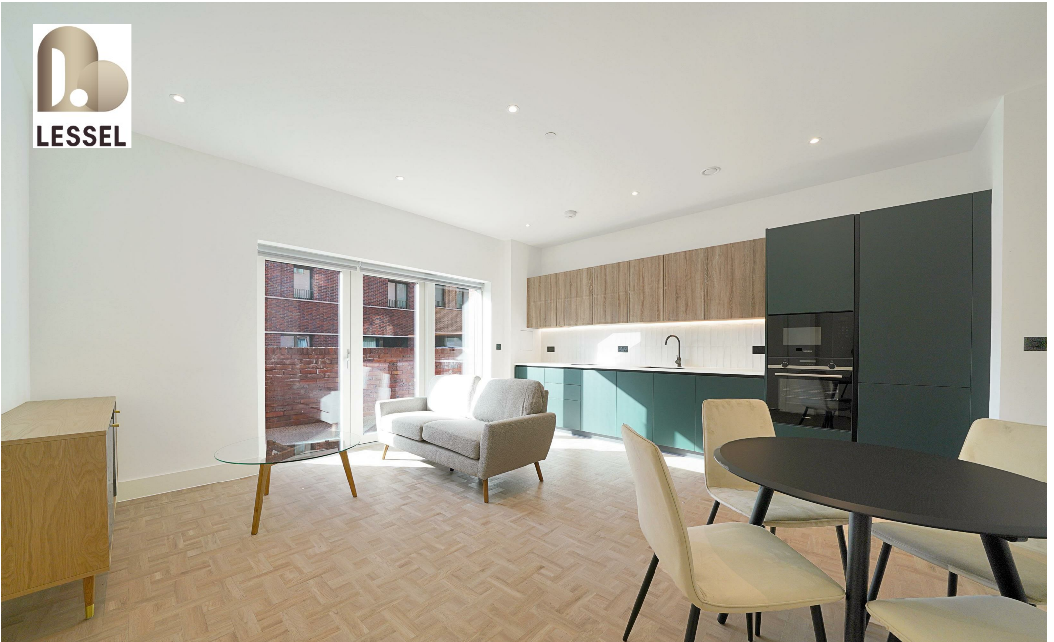
2 Viridis Apartments Monarch Square, London, SW11 1BZ £715 Per Week