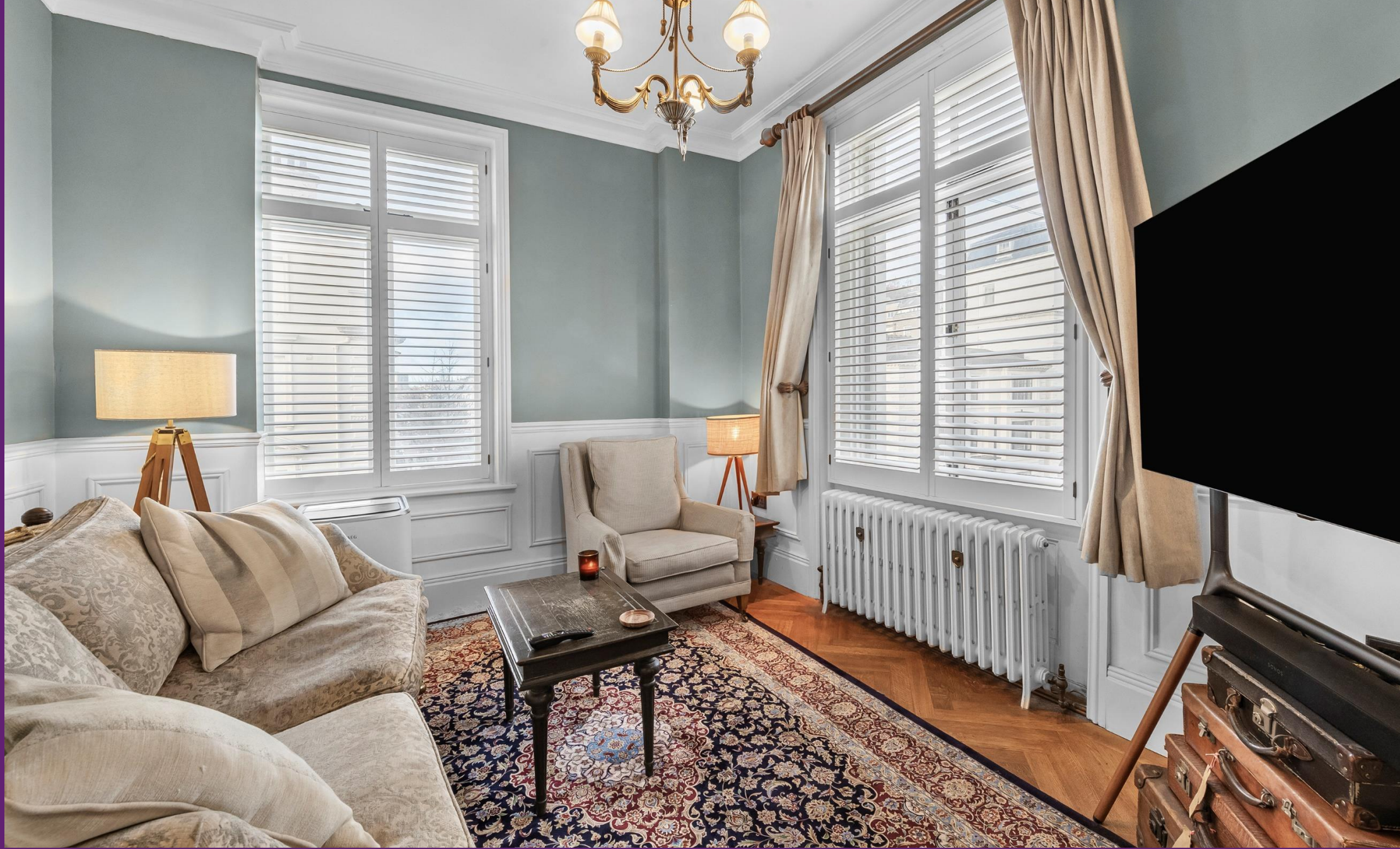
Gloucester Terrace Bayswater, W2