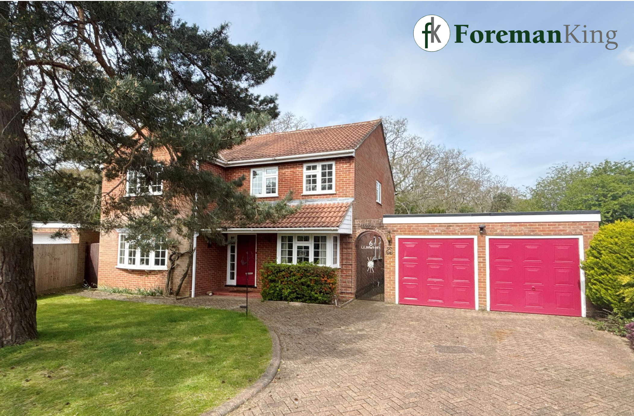
6 WOODLAND GLADE, FARNHAM COMMON, BUCKINGHAMSHIRE, SL2 3RG – GUIDE PRICE £1,150,000 FREEHOLD