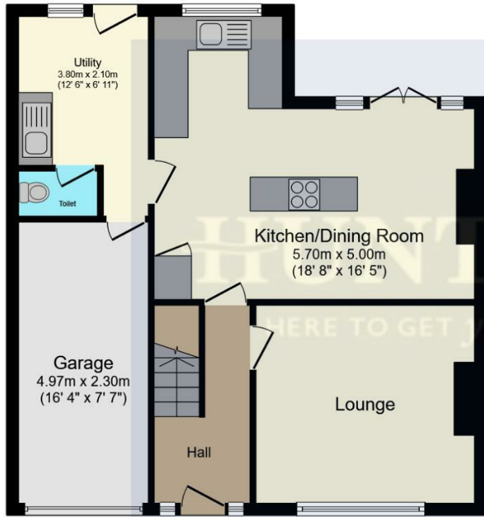
Ground Floor Floor area 63.9 sq.m. (687 sq.ft.)