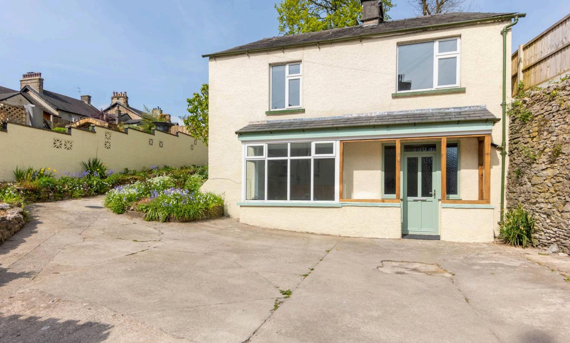
Ashwood Kents Bank Road, Grange-Over-Sands £275,000