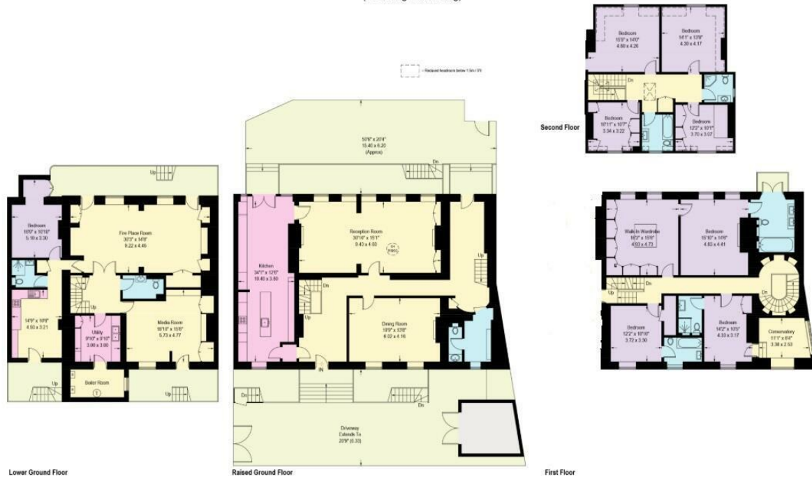
Illustration for identification purposes only, measurements are approximate, not to scale. (ID1256046)