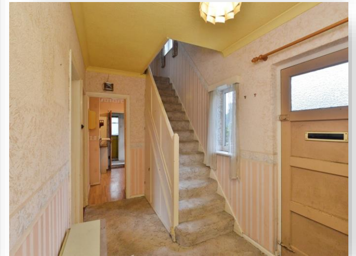
Church Close, Wicken Milton Keynes MK19 6BW