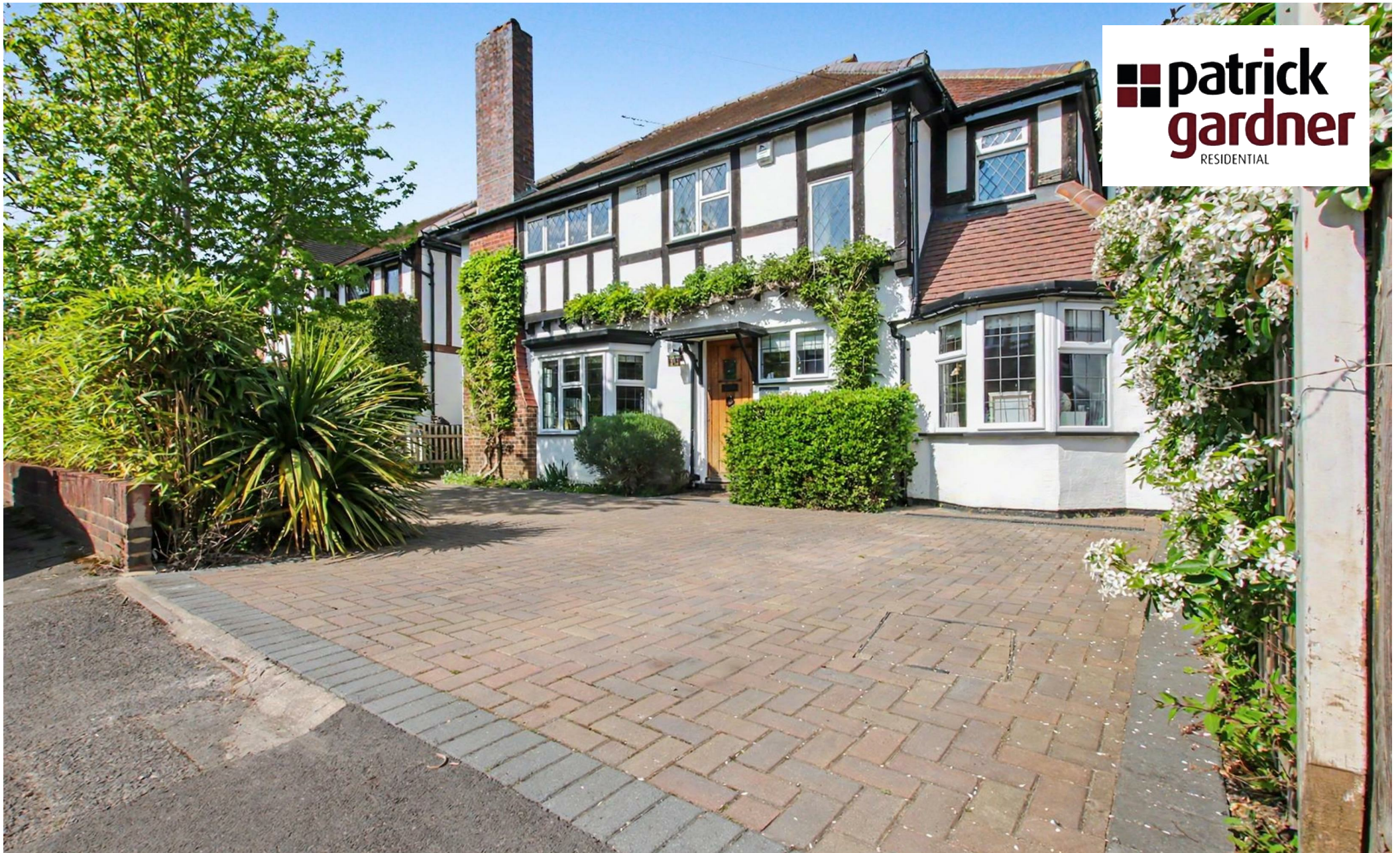
April Cottage 16 Squirrels Way, Epsom, Surrey, KT18 7AQ