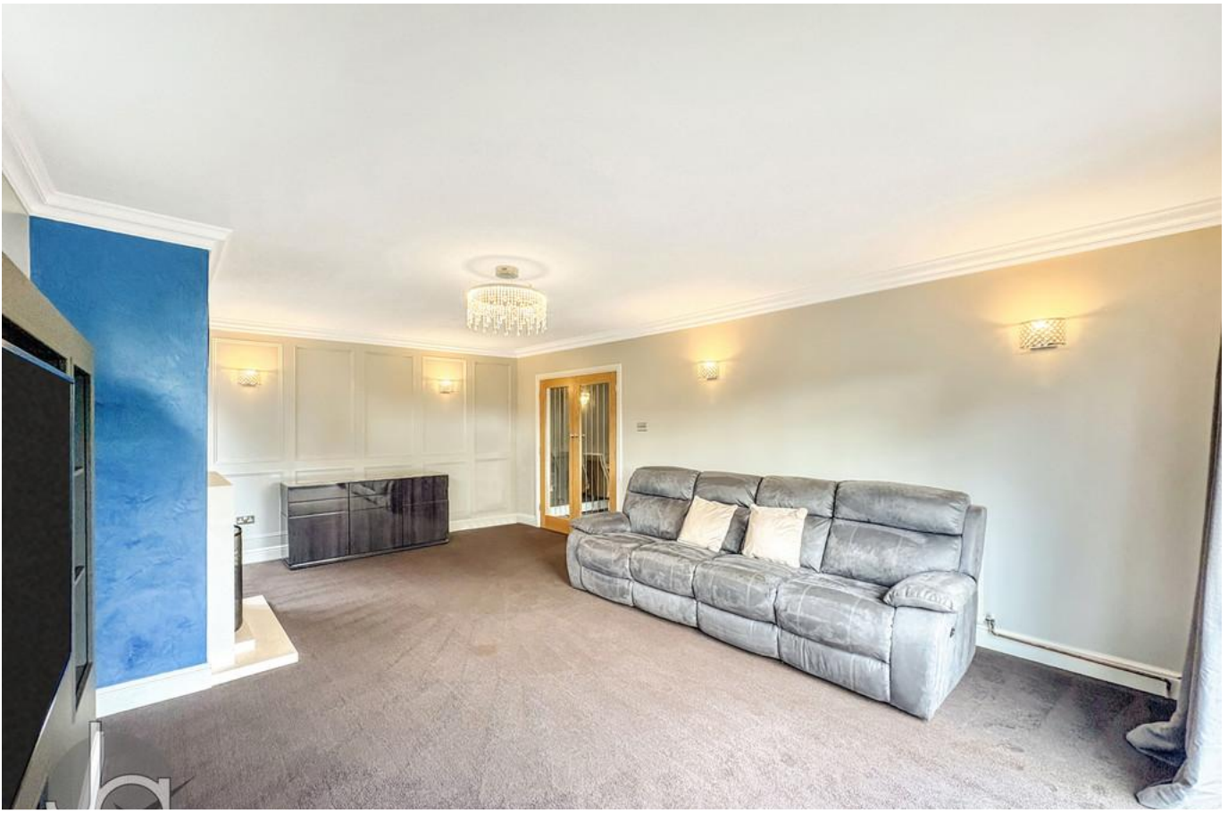
Chapel Road, Tiptree CO5 0RD