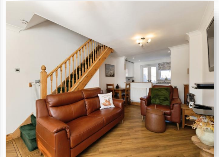
Elmwood, Coulby Newham Middlesbrough TS8 0SS