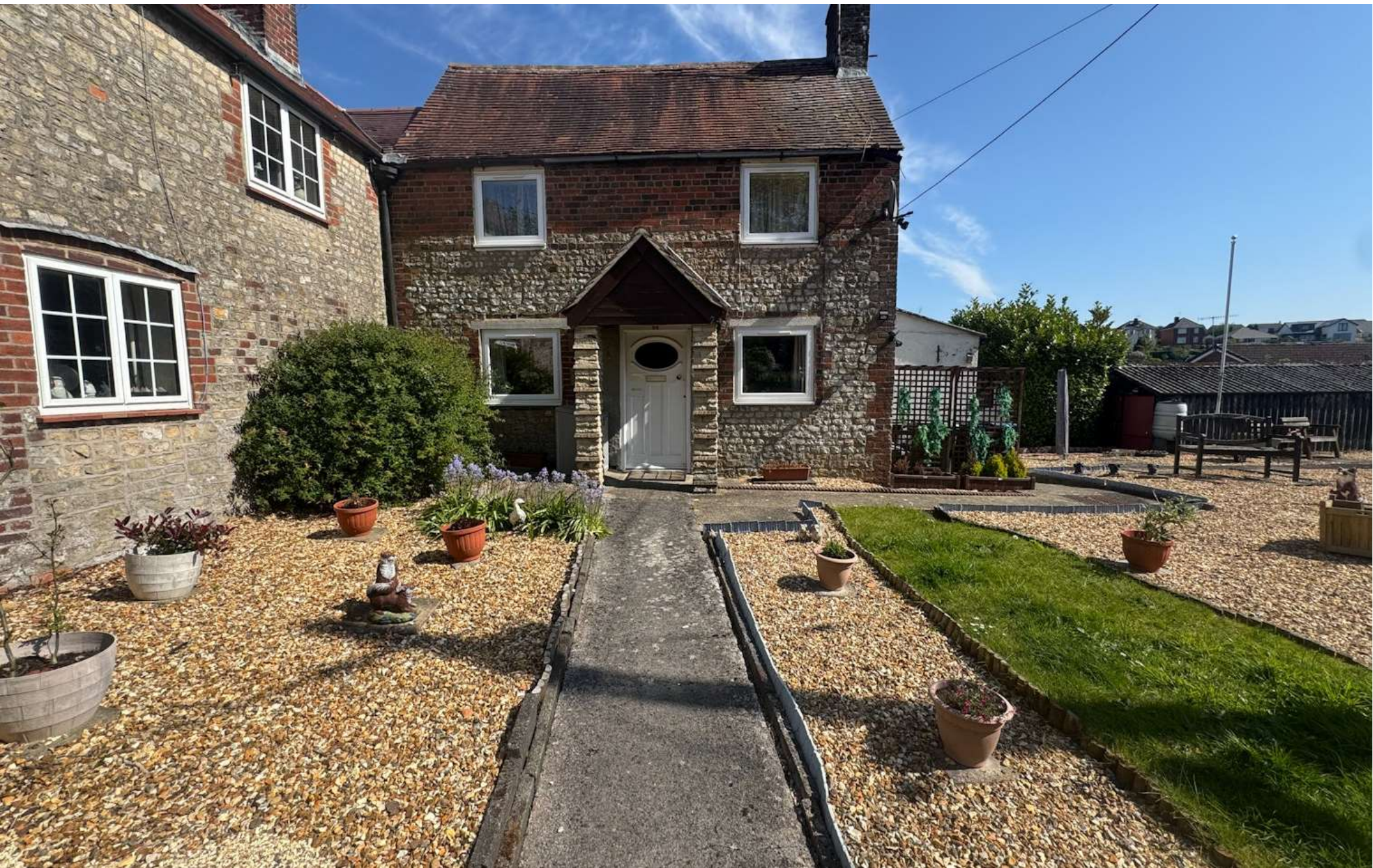
Marsh Street, Warminster