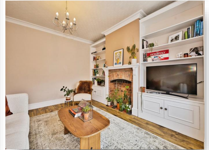
Glenville Road, Yeovil, BA21 5AF