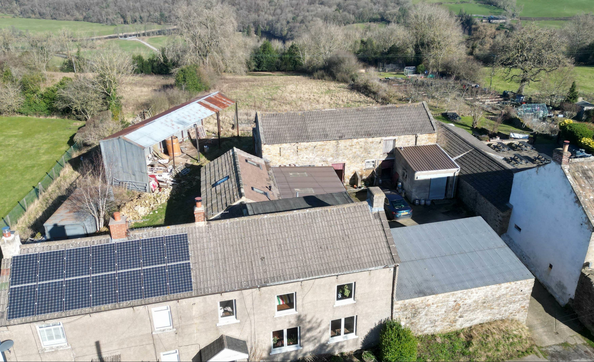
Moor Cottage Farm Hudswell, Richmond, N. Yorkshire, DL11 6BL