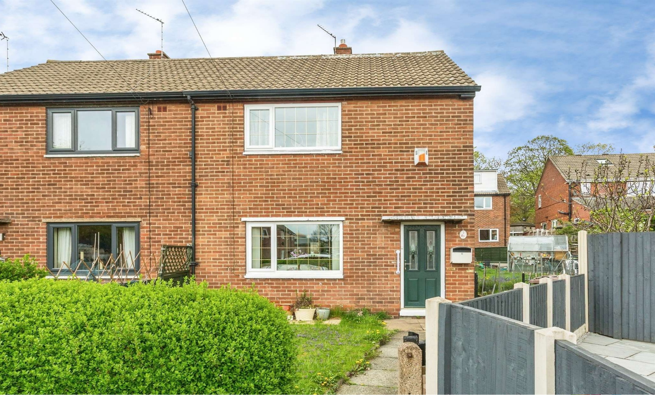
Moxon Square, Wakefield WF1 3SH