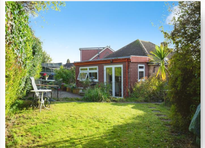
Bramber Close, Sompting Lancing BN15 0JA