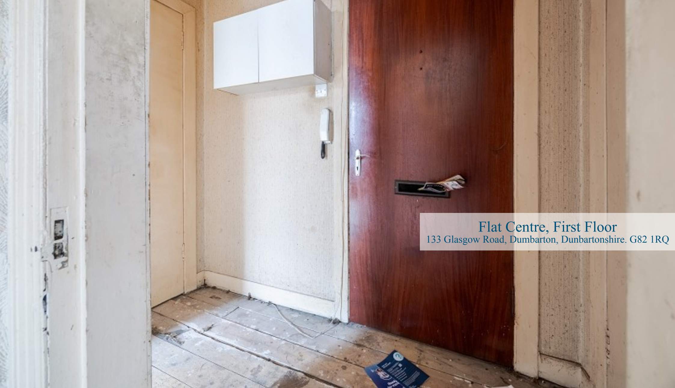
Flat Centre, First Floor 133 Glasgow Road, Dumbarton, Dunbartonshire. G82 1RQ