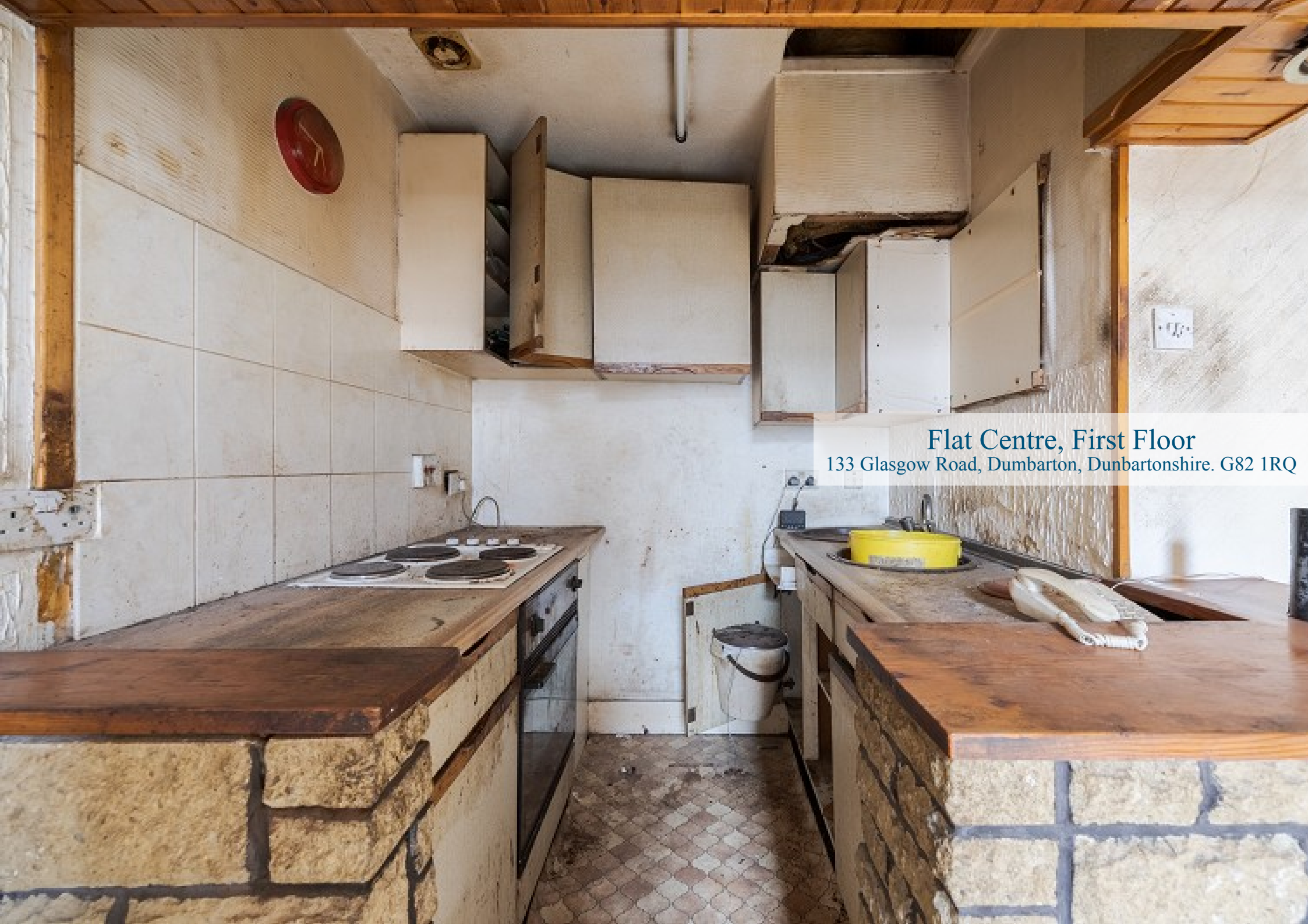
Flat Centre, First Floor 133 Glasgow Road, Dumbarton, Dunbartonshire. G82 1RQ