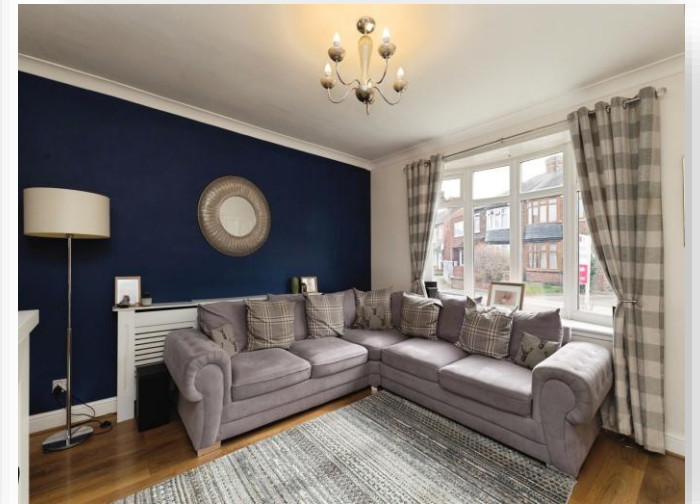
Harrogate Crescent, Middlesbrough TS5 6PS