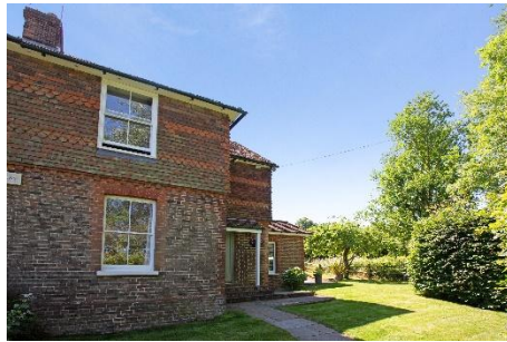
2 YORK VILLAS, TN17 1EJ