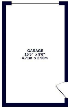
OUTBUILDING 147 sq.ft. (13.7 sq.m.) approx.