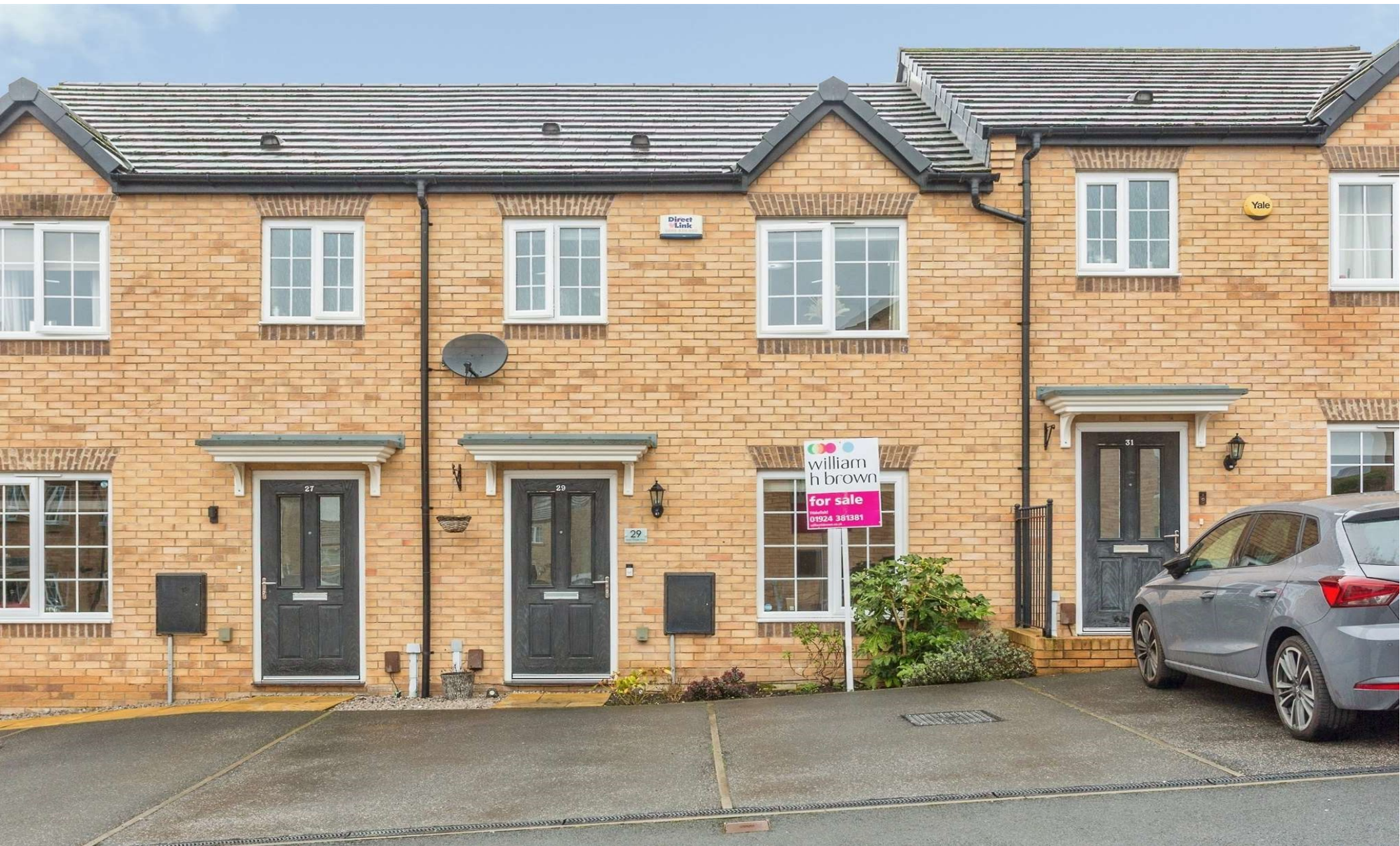
Wren Green Way, Wrenthorpe WAKEFIELD WF2 0FU