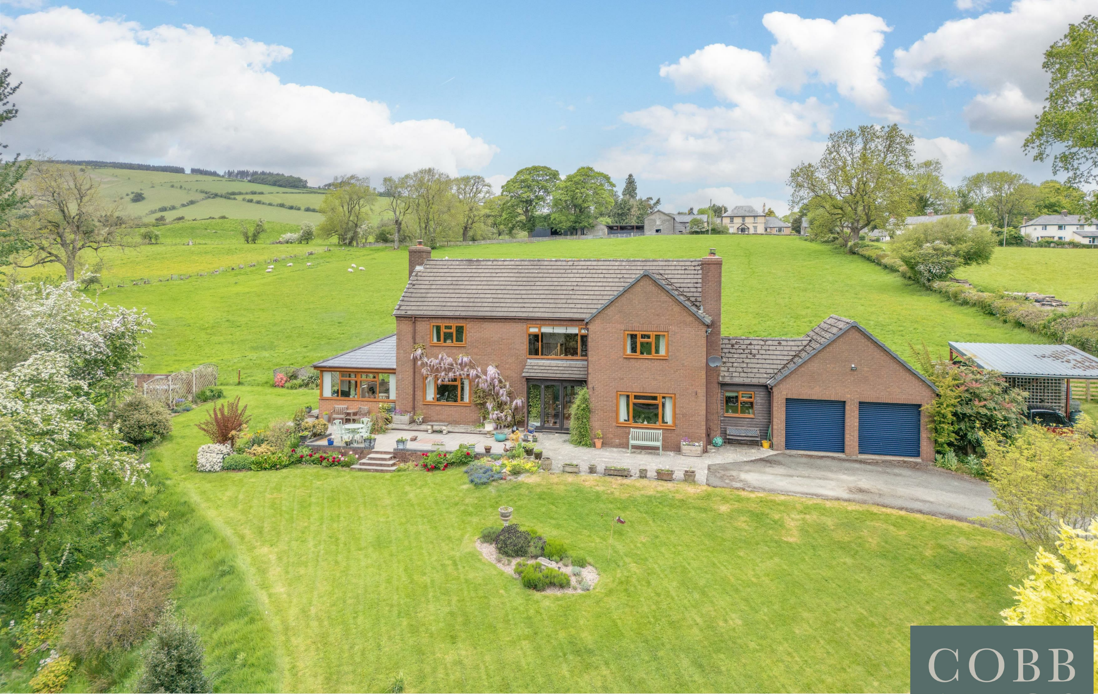
Osbern House, House with land, Kinnerton, Nr New Radnor, LD8 2PE Guide Price £695,000