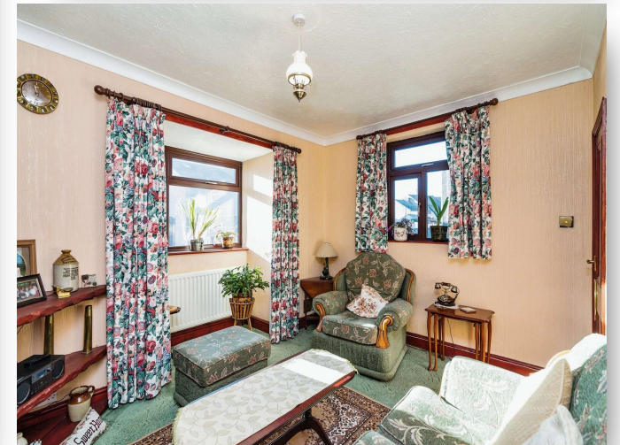
Cambridge Road, Lowestoft NR32 1TE