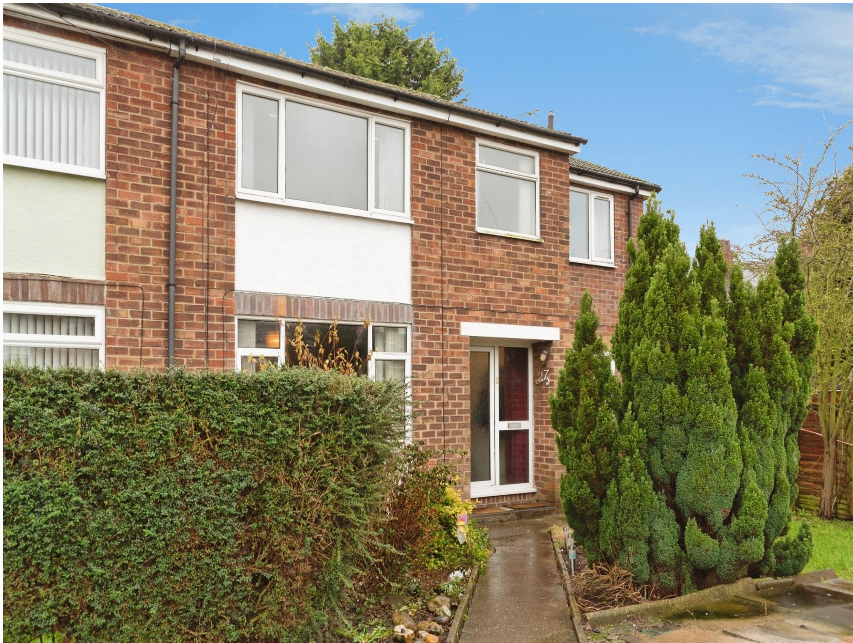
Lyndhurst Close, BEVERLEY, HU17 0QG