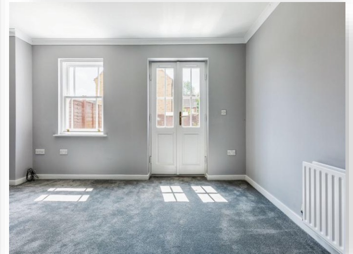
Irthlingborough Road, Wellingborough NN8 1LT