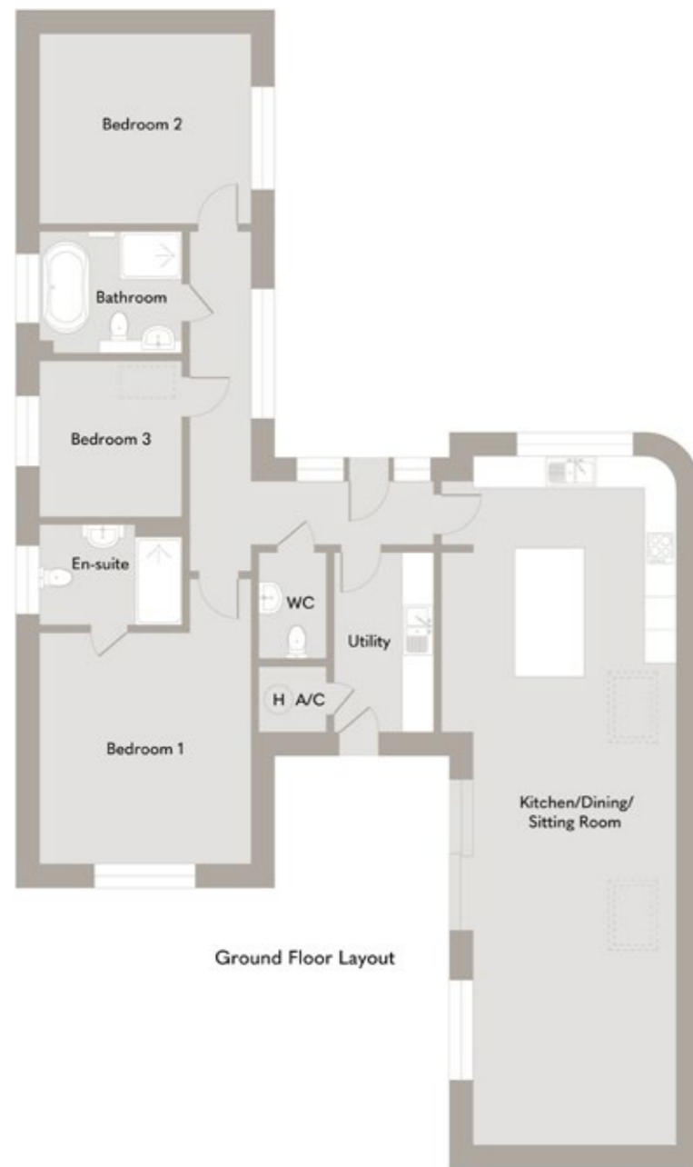
Ground Floor Layout

Working alongside a trusted in-house team and skilled local contractors, Devlin Developments have earned a reputation for delivering homes that are not only beautifully finished, but also deeply considered in the way they are lived in. Their collaborative approach and commitment to excellence continue to make a lasting impression across North Norfolk and beyond.