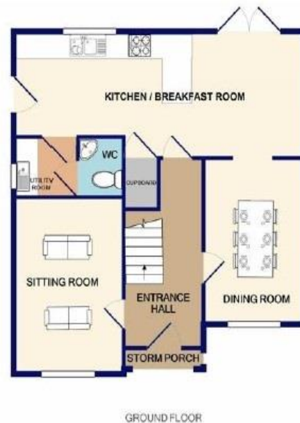
Four Bedroom Detached House Floor Plan (Plots 6 & 9) (not to scale for identification purposes only)