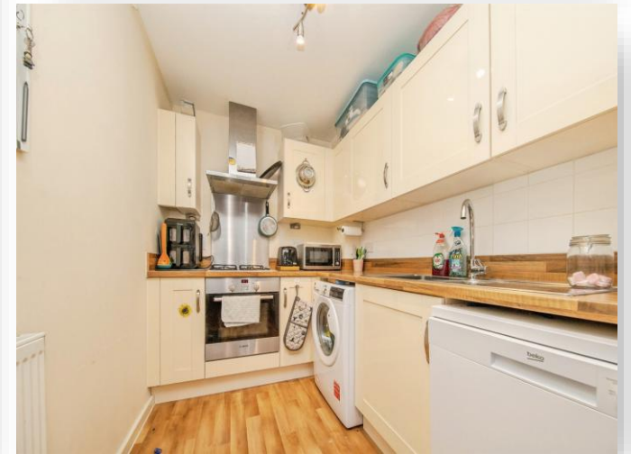
Masons Drive, Great Blakenham, Ipswich, IP6 0GE