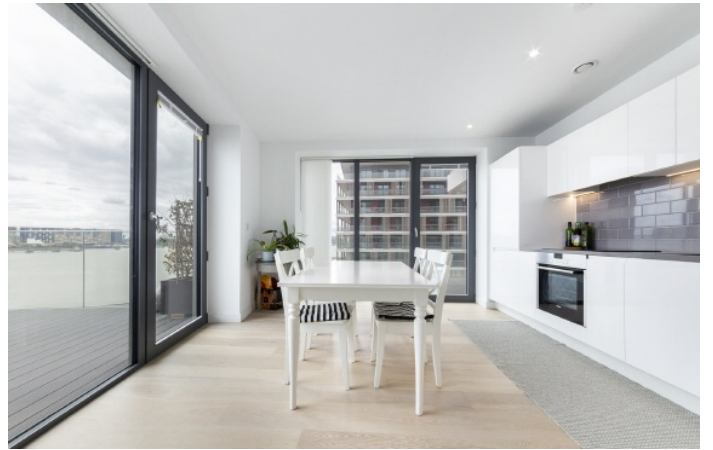
Bonnet Street, E16