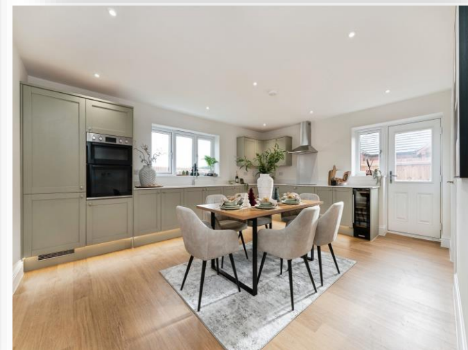
Rose Gardens, Manea PE15 0WX