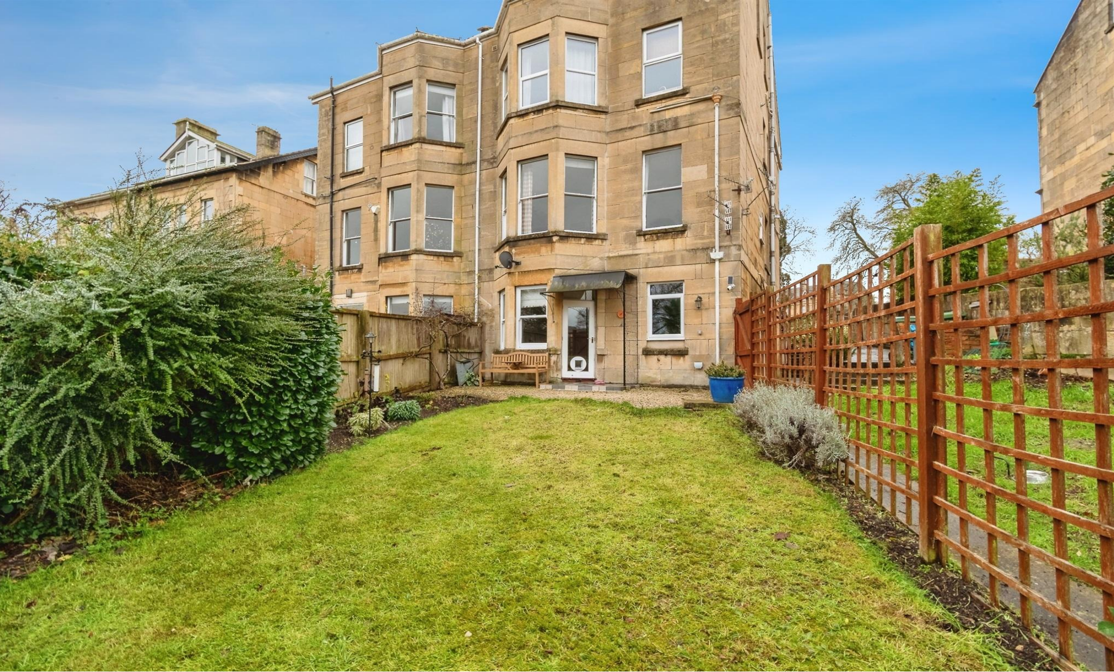
Garden Flat Lower Oldfield Park, Bath BA2 3HP