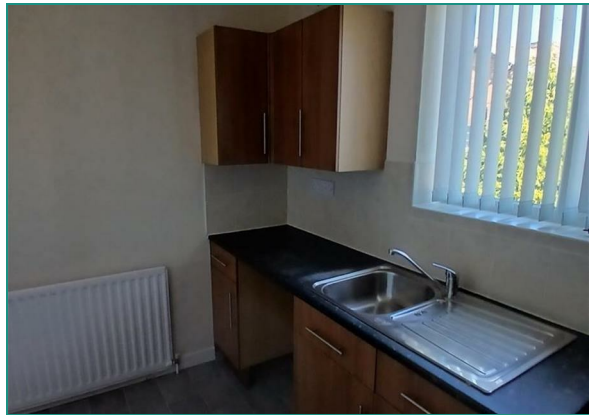
Arden Street Coventry , CV5 6FD £925 PCM