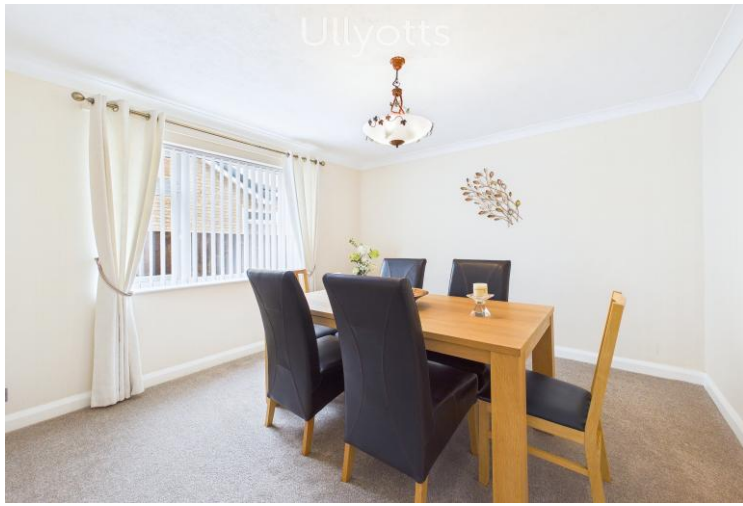
Dining Room/Bedroom 3