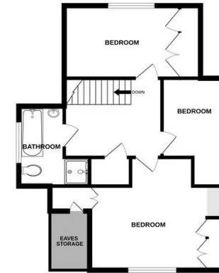
1ST FLOOR 552 sq.ft. (51.3 sq.m.) approx.