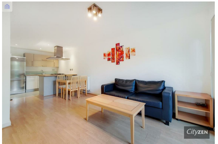
RECEPTION ROOM VIEW