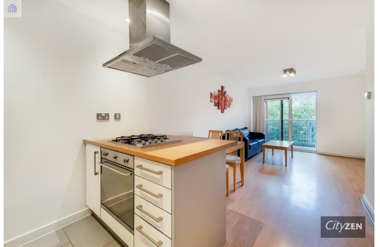
RECEPTION ROOM VIEW