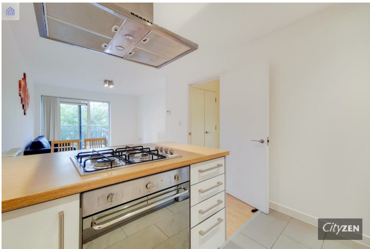
KITCHEN/RECEPTION ROOM VIEW