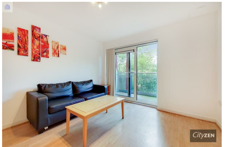
RECEPTION ROOM VIEW