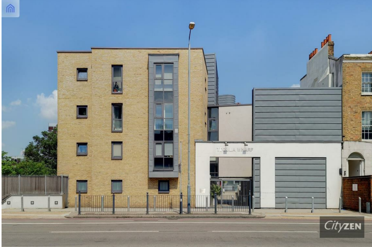
TEQUILA WHARF ENTRANCE