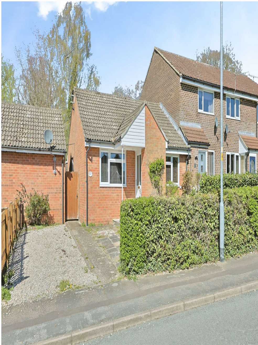
Wordsworth Drive, Dereham NR19 2SB