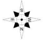
Illustration for identification purpose only, measurements approximate and not to scale.