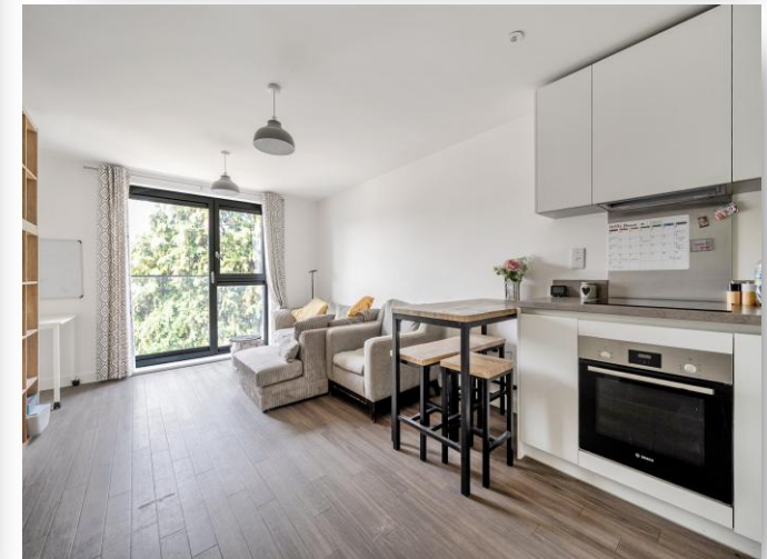
Apartment 37 Boulters Point, 99 Boyn Valley Road, Maidenhead SL6 4FU