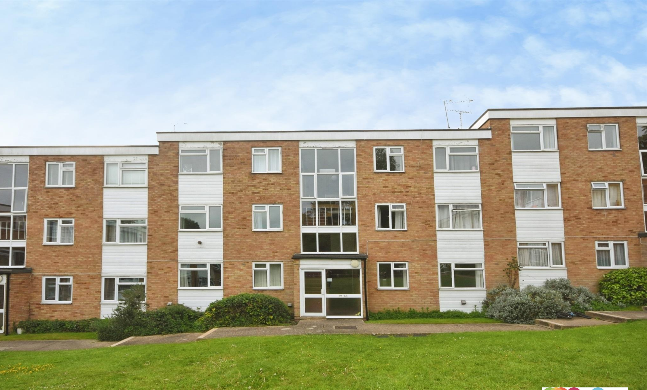
Haig Court, Chelmsford CM2 0BJ