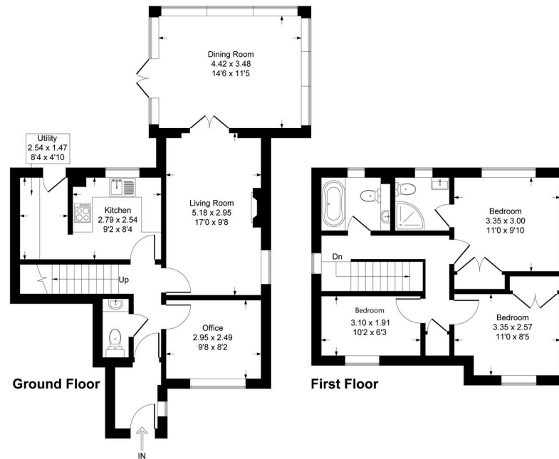
Illustration for identification purpose only, measurements approximate, and not to scale.