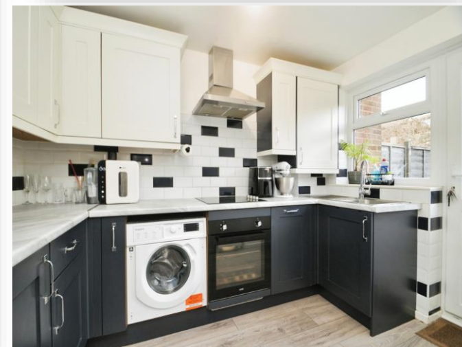
Park House Green, Harrogate HG1 3HW