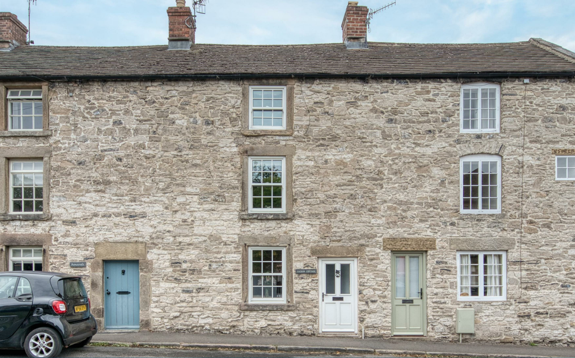
Cuckoo Cottage Main Street, Great Longstone, Derbyshire, DE45 1TA